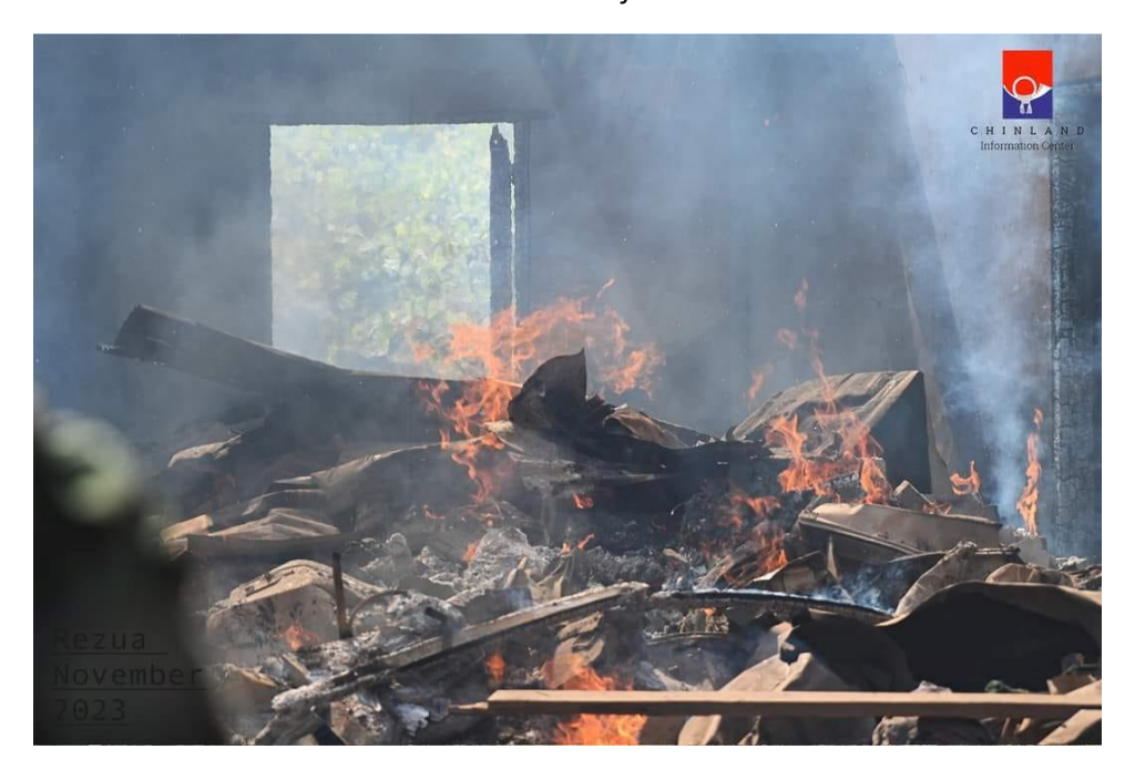
November 29, 2023 airstrikes in Rezua, Matupi Township, Chin State.