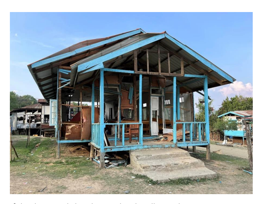
One of the destroyed churches in Tlanglo Village.

At the end of April, the Burmese military attacked Tlanglo village in Chin State with airstrikes. In the aftermath, two civilians were killed and eight were injured. Sources indicated that 19 homes and three churches at Tlanglo village of Thantlang Township were destroyed. The entire village was displaced.