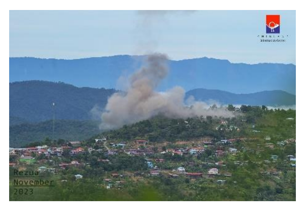
November 29, 2023 airstrikes in Rezua, Matupi Township, Chin State.

On the morning of November 29, 2023, Chin forces captured the junta military outpost at Rezua, Matupi Township, and took control of the town. The Chin forces included fighters from the Chin National Army, CDF Matupi (B2) and ZZLMS, a grouping that includes CDF-Zotung, CDF-Zophei, CDF-Lautu, CDF-Mara, and CDF-Senthang. On December 1, 2023, the Burmese military retaliated with airstrikes on the civilian population, destroying a church and displacing 2,000 people.