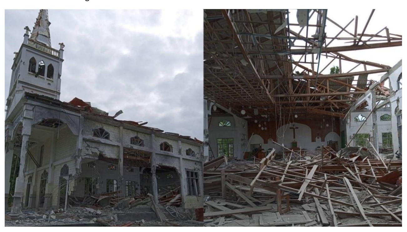
In 2021, the military shelled Mary Queen of Peace Catholic Church in Kayah State.

Kayah State has also been targeted by the Burmese military. Tens of thousands of civilians in Kayah State have been displaced and roads, bridges, homes, hospitals, schools, and religious buildings have been destroyed or damaged. The Progressive Karenni People Force (PKPF) estimated as of August, 2023, 42 religious buildings have been damaged, including 14 Catholic churches, six clergy homes, two convents, eight parish halls, one home for the elderly, one formation home, and one catechistate. These included Mary Queen of Peace Catholic Church in Pathein Parish in 2021 and St. Matthews Catholic Church in Dognekhu Parish in 2022.