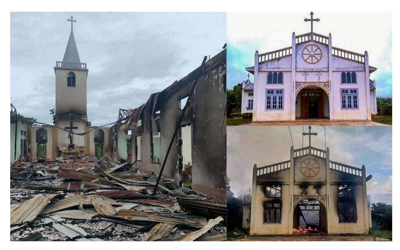
In 2022, St. Matthews Catholic Church in Kayah State was burned down by the Burmese military.