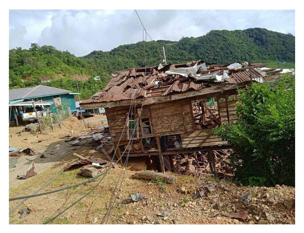
November 29, 2023 airstrikes in Rezua, Matupi Township, Chin State.