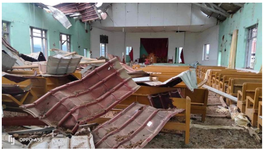
On August 12, 2023, military airstrikes destroyed Ramthlo Baptist Church in Ramthlo, Chin State.